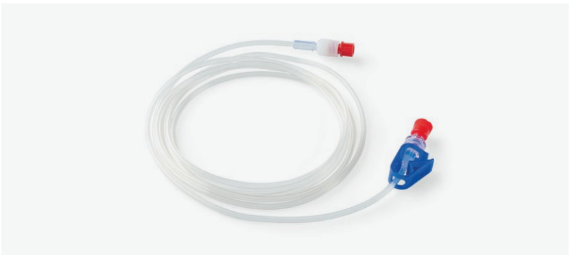
Single Infusion Line