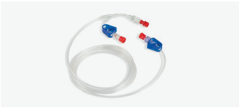
2-way – Dual