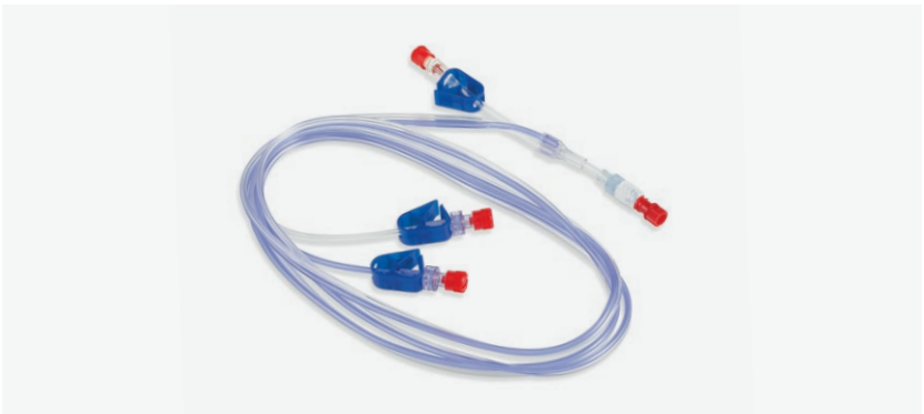
3-way – Triple