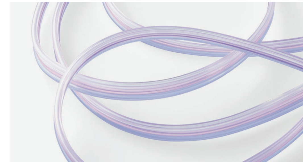
Siamese configuration to prevent entanglement of tubing