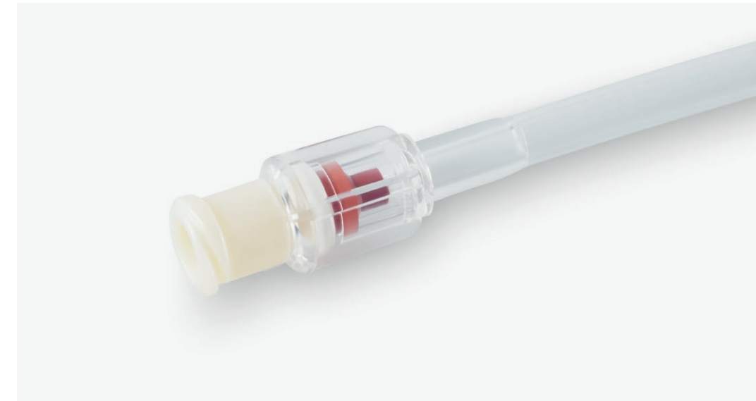
Anti-reflux valve to prevent back flow