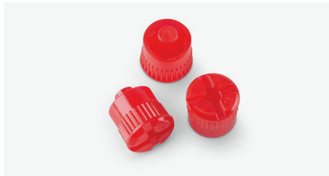
Red end caps always highly visible