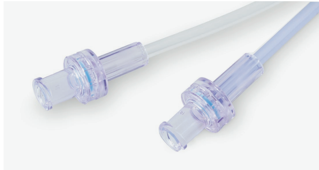
Anti-Siphon valves to prevent back flow and free-flow