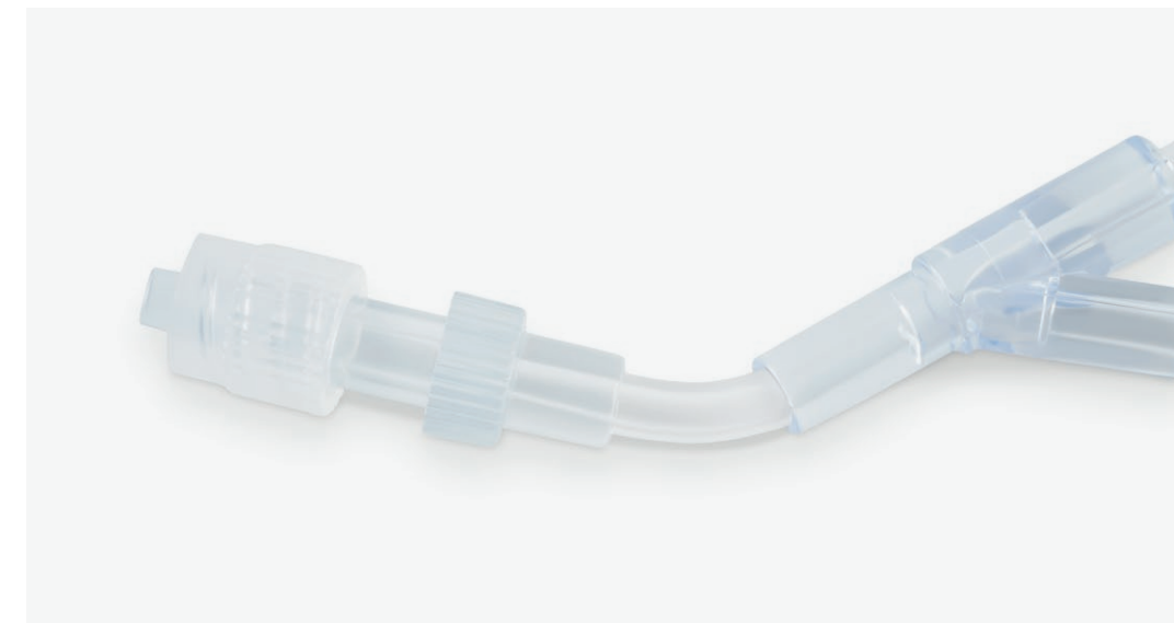
Soft distal end to provide minimal stress at the cannula site